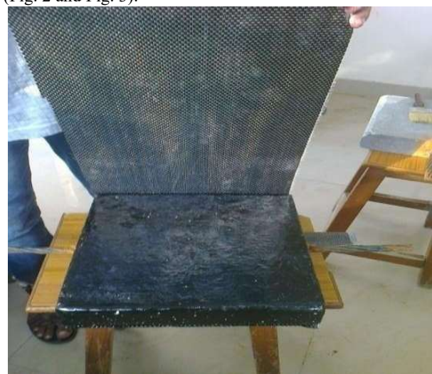
Fig. 2 Wrapping of FRP sheet after coating Epoxy paint [10].

Firstly, the samples are air dried prior to the application of FRP wraps and grinder is used for rounding off the sharp corners. Manufacturer specifications are followed in the application of the wraps. A Wire Brush is used for roughing of slab surface so as to have proper bond between slab surface and epoxy. Conductive Epoxy in the ratio of 100:40 is used for wrapping the carbon fibre sheets onto concrete (Fig. 2 and Fig. 3).