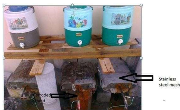
Fig. 1 Block Specimen subjected to 5% NaCl Solution [10]

By continuously dripping with 5% NaCl solution specimens are kept fully saturated (Fig. 1). The strand is used as anode. A stainless steel (SS) mesh is rolled around 300 mm length of specimen and tied together with metal ties in order to assure electrical continuity is used as cathode. The constant voltage of 5 mV is impressed in order to accelerate corrosion