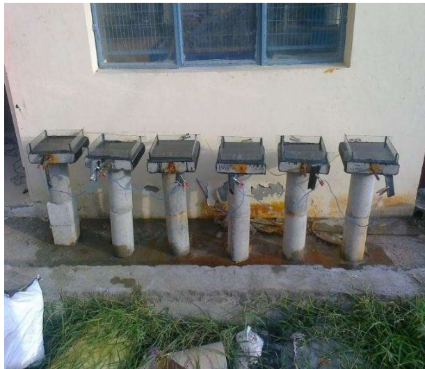
Fig. 4 Set up of slab specimens for Active Protection [10]

To simulate corrosion damaged structures, prior to the application of wrap, an initial exposure is applied whose time of exposure was so adjusted so as to have three levels of damage namely (i) onset of corrosion, (ii) onset of visible crack, and (iii) 2 days after onset of visible crack are applied. After initiation of corrosion the specimens are allowed to be wrapped with FRP sheets and also a constant anodic current of 10 mA is supplied with CFRP sheet as anode and tendon as cathode. Specimens for Active Protection in which positive terminal are connected to the carbon fiber ribbon and the negative terminal is connected to the pre-stressing strand (Fig. 4). Corrosion monitoring is done as explained earlier using half-cell potential and LPR measurements for a period of 30 days [10].