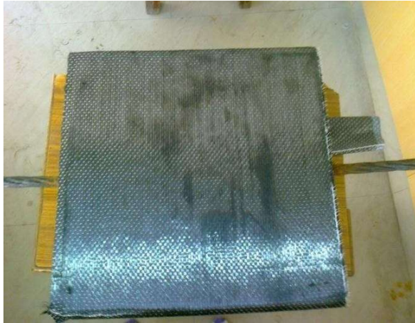
Fig. 3 FRP wrapped on concrete surface [10]