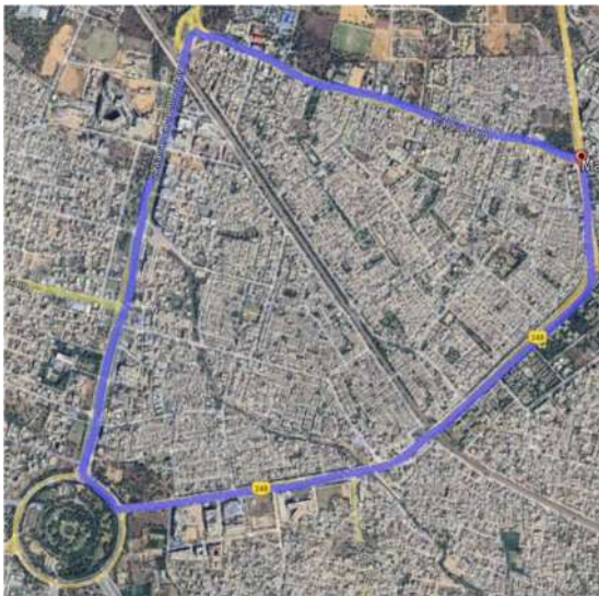
Figure 1: Google Imagery for Malviya Nagar, Jaipur.

Jaipur is amongst few of the first planned cities of Modern India. The southern region of the city has neighbourhood named Malviya Nagar after the freedom fighter Madan Mohan Malviya. Currently, it's one of the poshest and most upmarket locations in Jaipur city. Its house to numerous government housing scheme while also caters to large number of private developers too. It has amenities as schools, universities, hospitals, Techno hub, restaurants, malls, showrooms and many other attractions. The neighbourhood is well connected with all the prime locations of the city, while the airport also being just 5-10 minutes away. The total area for Malviya Nagar is 3.284 sqkm (Source: Jaipur Development Authority) housing a population of 29033 persons (Source: Census Report 2011)