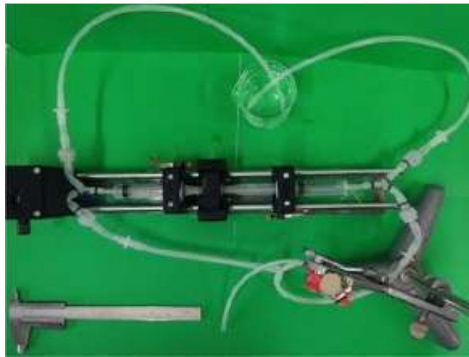
Figure 3.1 Pictorial Representation of PUSH-PULL SYRINGE PUMP [4] diagram

The pump will turn on when the power plug is plugged in, and each time it does, the system will run an Auto Home to reassess the location and distances.