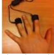
Fig. 3 GSR electrodes attached to fingers