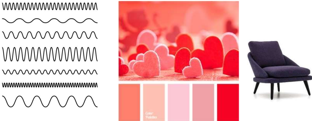
Fig: Lawson Arm Chair